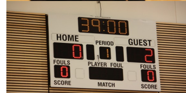
The Scoreboard after the Gold-Medal Game